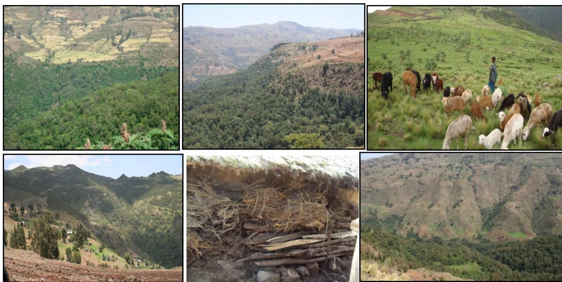
Figure 3. Manifestation of pressure on the park: partial (expansion of agriculture, no buffer zone, edge side effect, grazing, expansion of settlement, firewood collection, no water and soil conservation around the park

highly needed by the respondents include grass and leaves for animal forage (92.5%), wood for farming and household utilities (90.6%), the forest for bee keeping (82.5%), wood for fuel and construction (76.3%) followed by land for farming (41.3%). The need of water for livestock and irrigation, wild animals for their meat and skin, wood for commercial purpose and wood for charcoal were minimal. During field observation, the researcher observed that cultivation was expanded up to the edge of the forest, all steep slopes and gentle slopes were changed in to cultivation fields. There are no